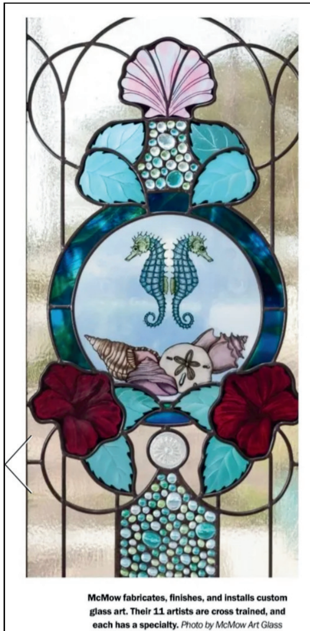
McMow fabricates, finishes, and installs custom glass art. Their 11 artists are cross trained, and each has a specialty.