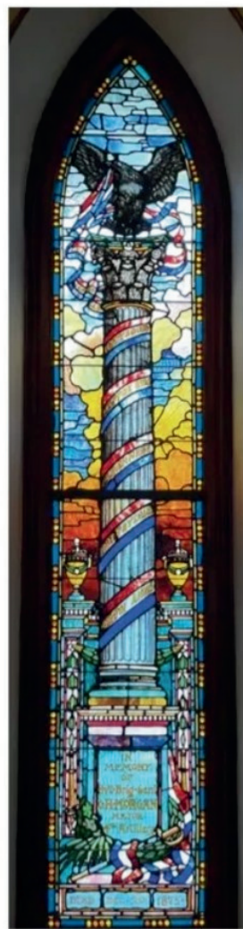
Above left, at the Cuban Embassy in Washington, D.C., Lynchburg Stained Glass removed the 1917 building's stained-glass skylight that crowns its four-story atrium, preserved it, re-leaded it, and reinstalled it. Right, Lynchburg Stained Glass removed, restored, and preserved eight historic stained-glass windows at the Chapel of the Centurion at the Fort Monroe National Monument in Hampton, Virginia.