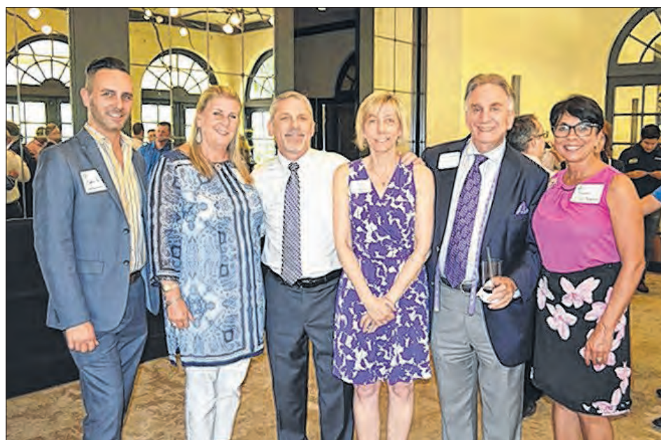
The Chamber's September Business After Hours was hosted by the elegant Café Boulud at the Brazilian Court Hotel. Special thanks to the General Manager and wonderful staff.